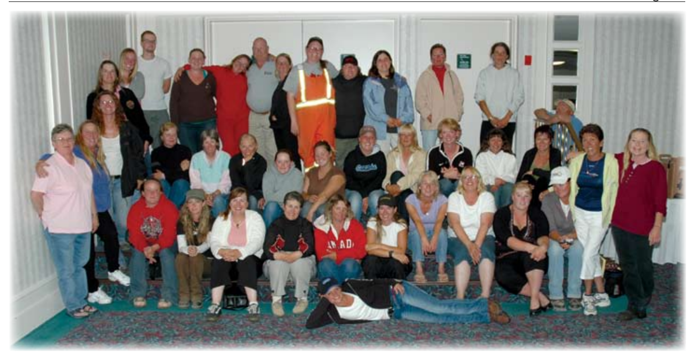
Local 258 IBEW members working for Valley Traffic in the lower mainland took a moment to pose for a photo at their recent union meeting held in Surrey.

of a letter of agreement, it can be just as easily taken away by the employer. We will notify the members of this bargaining unit when the letter is secured, including the details," Longva advised.