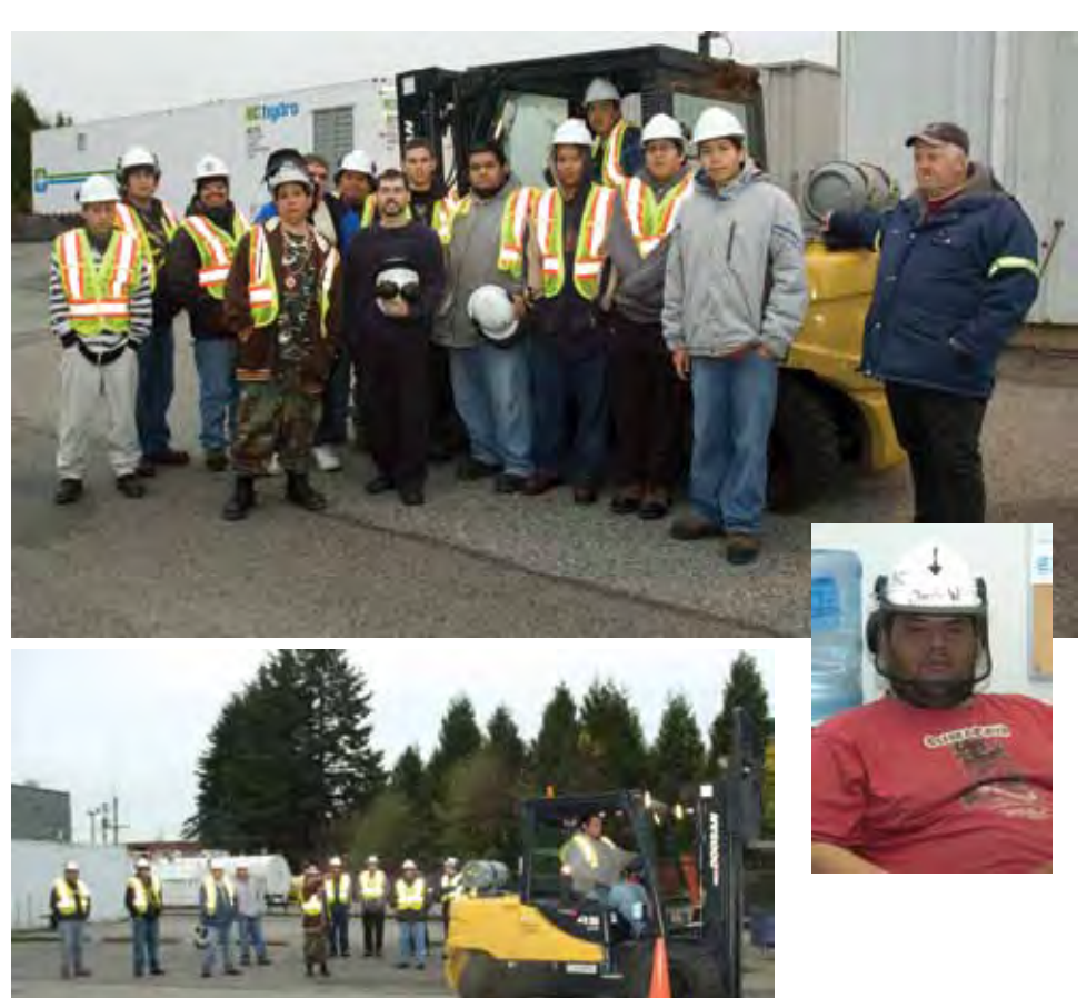
Students from Seabird Island First Nation's electrical utility training program attended specialized classes at the union's training facility in Surrey, the Electrical Industry Training Institute.

dedicated, conscientious and eager to learn." Upon graduation, the students will be qualified for further entry level trades training.