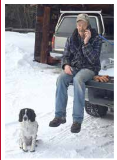
It seems I receive most calls while I'm outside - with my assistant.

I hope you all enjoyed a Merry Christmas season and have started the New Year with good health and happiness.